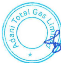
Gautam S. Adani Chairman

For and on behalf of the Board of Directors,